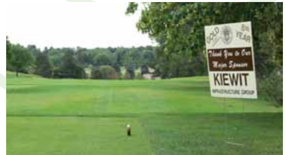
Many thanks go to the generous sponsors of the tournament.

Thank you to Southwest Sertoma and all of the generous sponsors, golfers and donors for another tremendously successful tournament. The tournament raised $18,000 for CHSL!