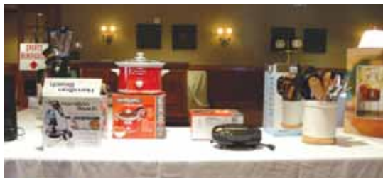
The silent auction was filled with wonderful items.