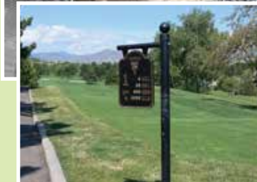
Award-winning Pinehurst Country Club provides the perfect setting for the tournament.