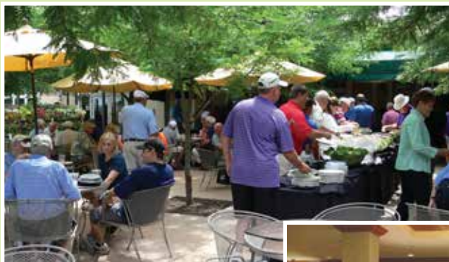
Golfers enjoyed a sumptuous buffet lunch before teeing off.

The tournament raised $22,000 for CHSL. Watch for announcements about next year's tournament!