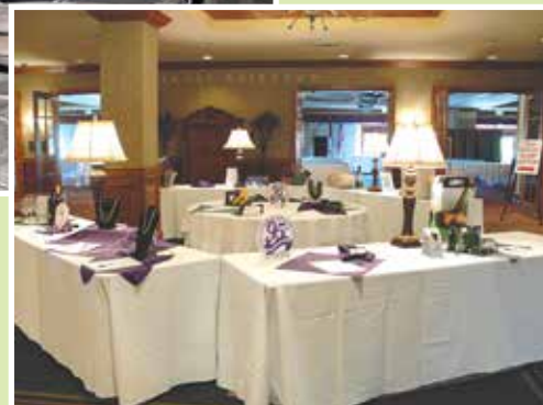
The ladies of LaSertoma organized the silent auction which was filled with wonderful items.